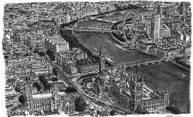
Aerial view of Houses of Parliament and Westminster Abbey, London, illustrated by Stephen Wiltshire.

In January 2006, it was announced that Stephen was being named by Queen Elizabeth II as a Member of the Order of British Empire, in recognition of his services to the Art world. Later that year he opened his permanent gallery in London. Work from Stephen's entire career is permanently on display, at the Stephen Wiltshire Gallery in the Royal Opera Arcade, Pall Mall, London.